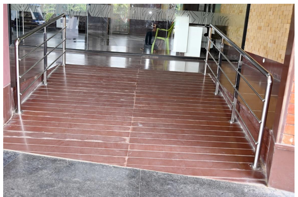
Ramps for physically challenged.

Research and Innovation : DSU is actively involved in research that addresses inequalities, including disparities in healthcare, gender inequality, and income inequality. Research activities contribute to understanding and mitigating societal issues related to inequality. But these are still at nascent stage since the University itself is at a nascent stage starting its operations in the year 2021.